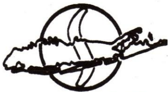
OFFICIAL PUBLICATION OF THE LONG ISLAND CHAPTER, SDC

NOTE: YOU MUST BE A MEMBER OF THE SDC TO JOIN A LOCAL CHAPTER.