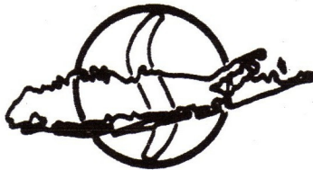
OFFICIAL PUBLICATION OF THE LONG ISLAND CHAPTER, SDC

NOTE: YOU MUST BE A MEMBER OF THE SDC TO JOIN A LOCAL CHAPTER.